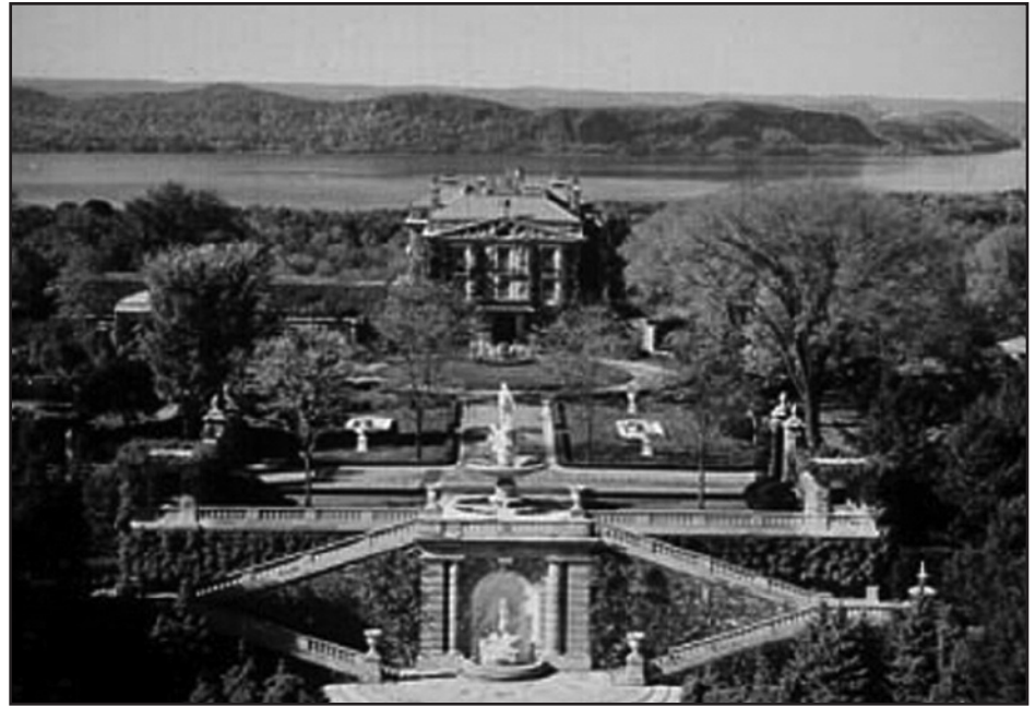
Nearby Rockefeller Estate, Kykuit Along The Scenic Hudson River

If you have never attended an Association annual meeting before, this would be the one highly recommend-